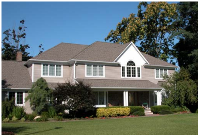
Set in one day, finished in weeks

Your tax bill contains important information about your property. A quick review will tell you the section, block, lot number and size. When planning your construction you are going to need to consider the zoning requirements that typically govern the size and location of a structure in relation to the lot. Make a copy of your tax bill and have it handy. If you don't know your zone, you can bring your tax bill to your town offices and they can look it up.