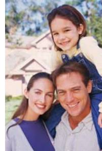
The home of your dreams

Besides choosing a reputable builder like Ballymore, you may need an architect, surveyor, landscaper, banker, a lawyer and other professionals who will help you obtain the home of your dreams. You can build a custom home or addition or consider plans from our exciting collection. Likewise we'll be happy to provide an introduction to any professional you may need so you can find the best match.